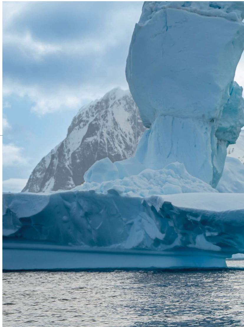
Zodiac cruising Pleneau Island, Antarctic Peninsula

Step ashore and get up close and personal with the local penguins for that perfect photo opportunity. Journey alongside polar specialists and share in their vast knowledge of these isolated regions.